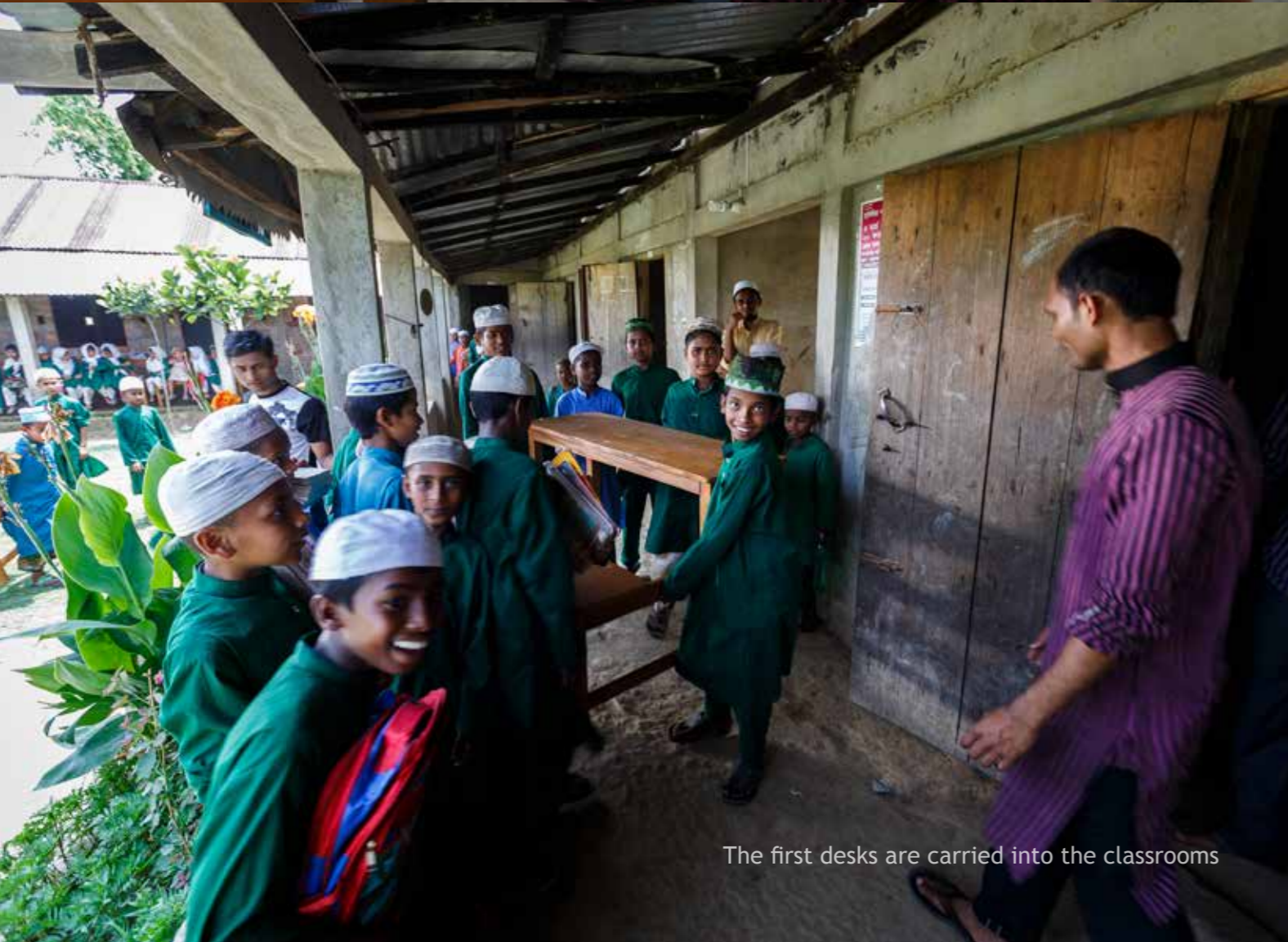
The first desks are carried into the classrooms