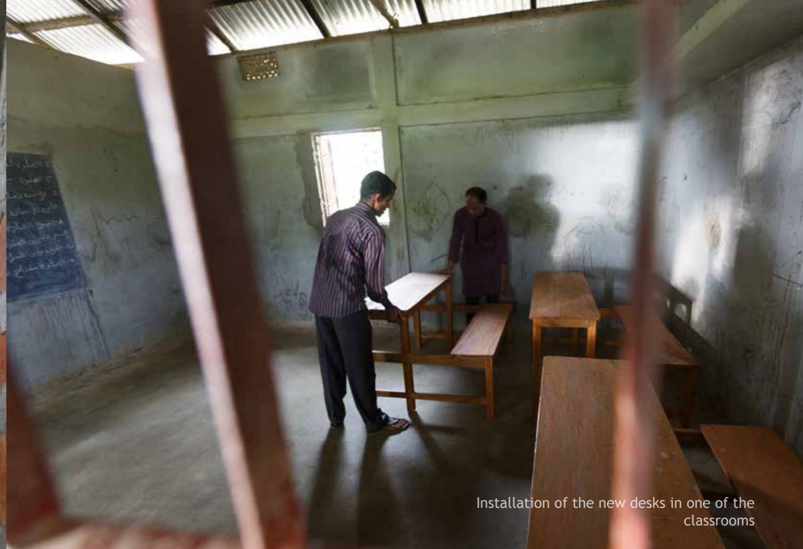
Installation of the new desks in one of the classrooms