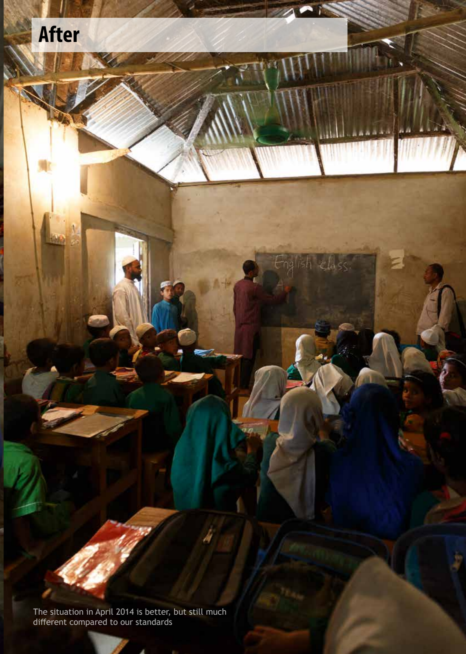
The situation in April 2014 is better, but still much different compared to our standards