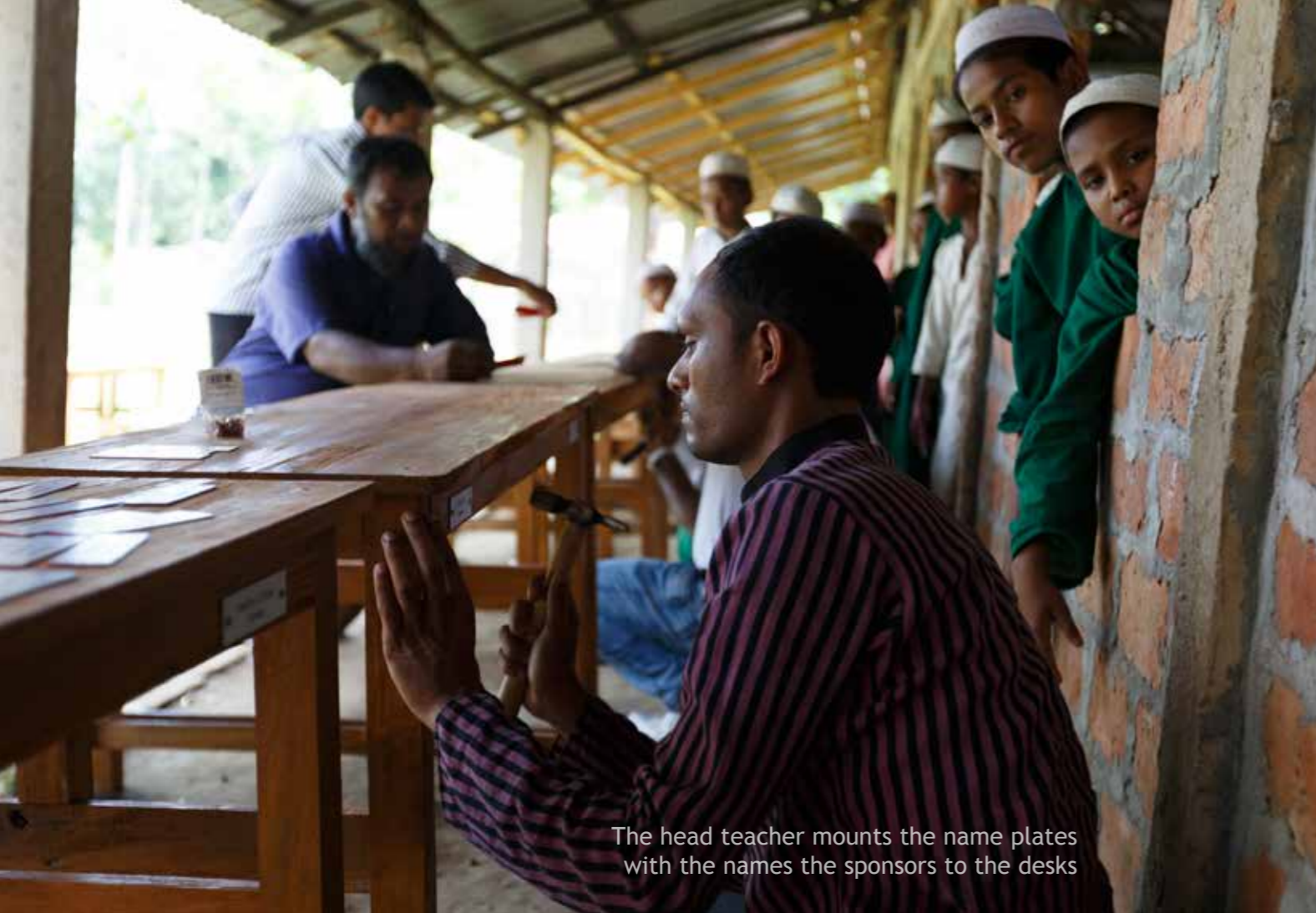
The head teacher mounts the name plates with the names the sponsors to the desks