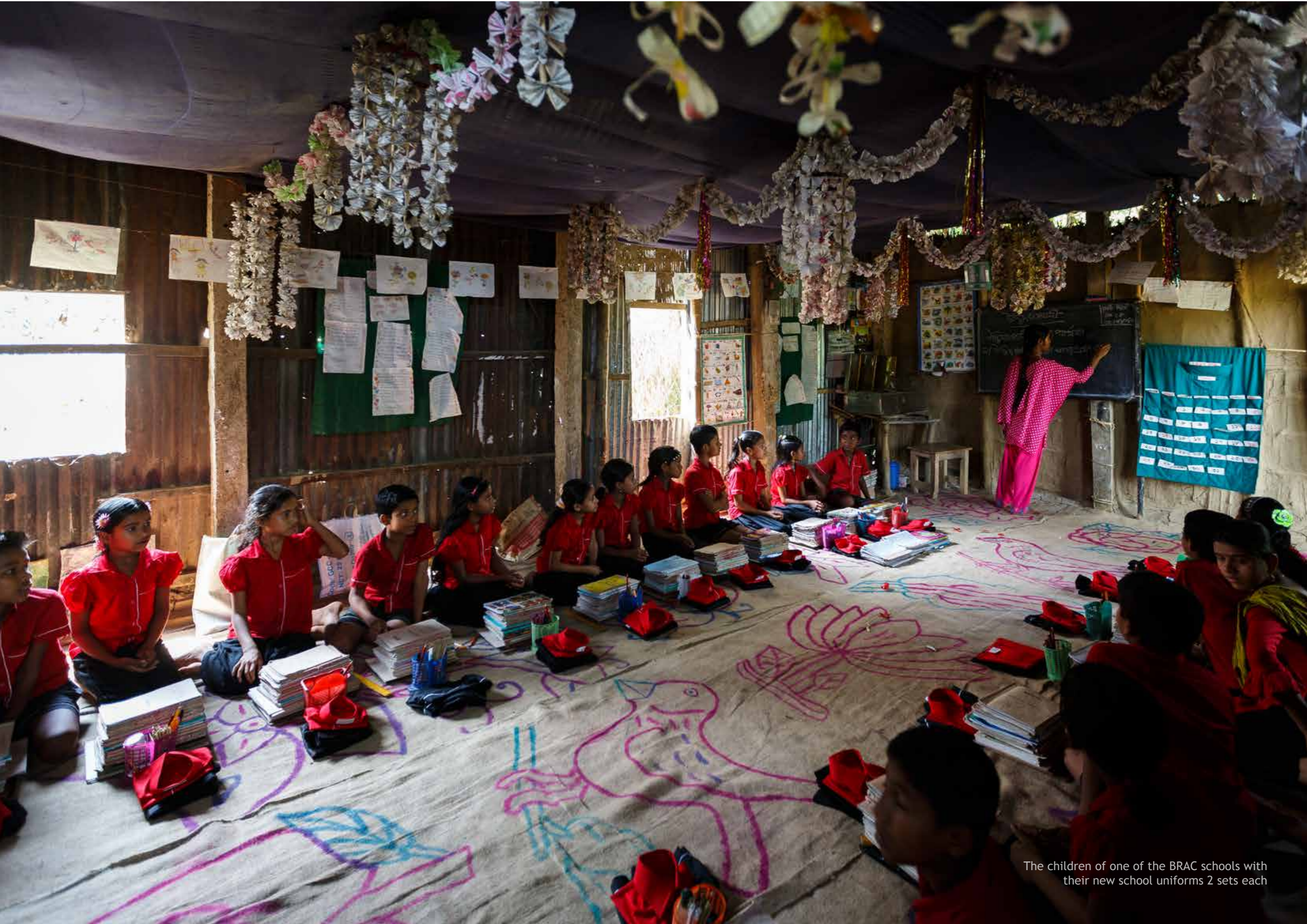
The children of one of the BRAC schools with their new school uniforms 2 sets each