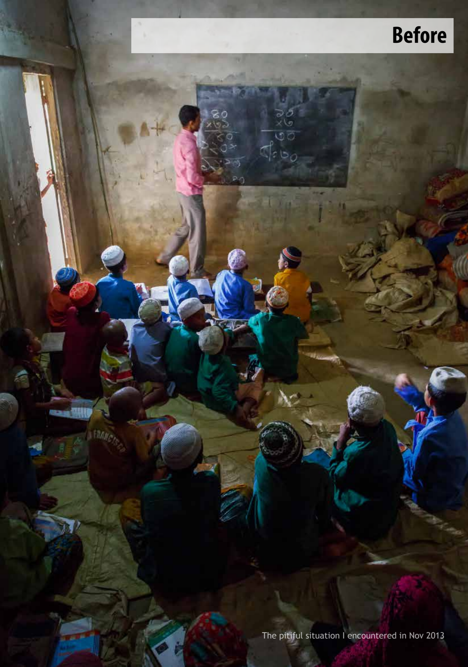
The pitiful situation I encountered in Nov 2013