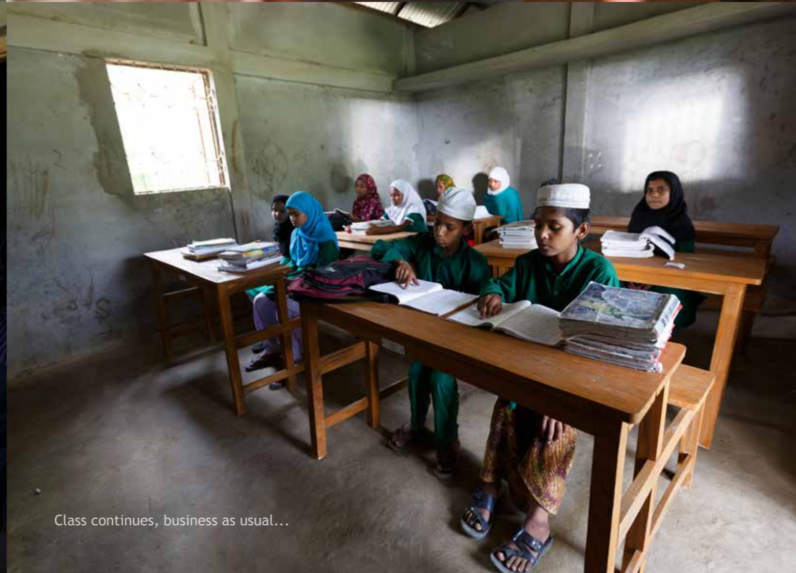
Class continues, business as usual...